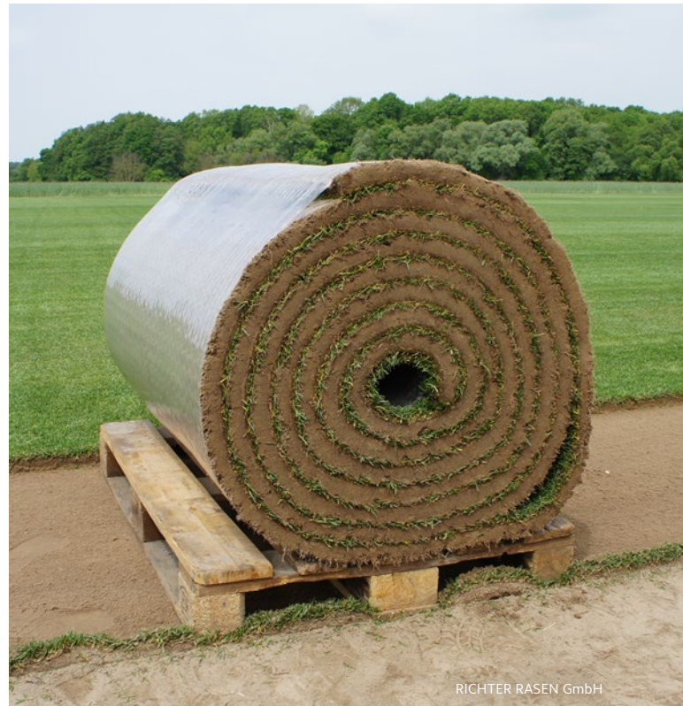
RICHTER RASEN GmbH

But also in the lawn renewal and -renovation in the golf and sports field care for the rapid establishment of a stable and resilient turf is the application of Basfoliar® Root Booster SL is recommended.