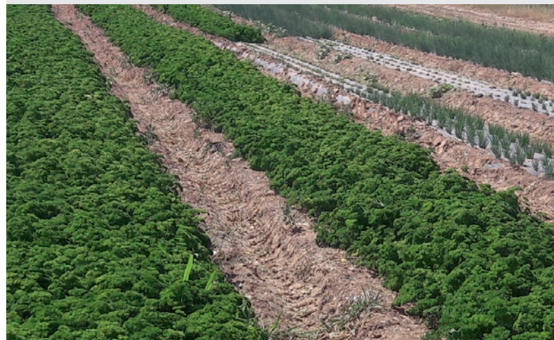
On the left: Basfoliar® Root Booster SL in parsley, on the right: control