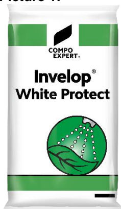
Invelop® White Protect – 100% natural